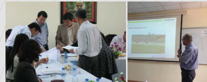
train@mine-Workshop for the Vietnamese mining company VINACOMIN, Hanoi